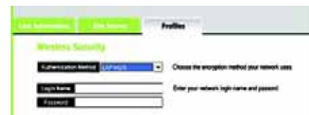
Figure 6-21: EAP-MD5 Authentication